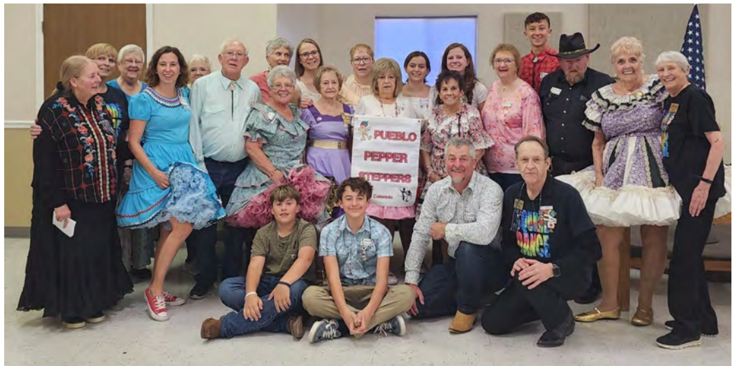
Dancers take a break from squaring up at a recent Pepper Steppers dance to pose for a group photo.