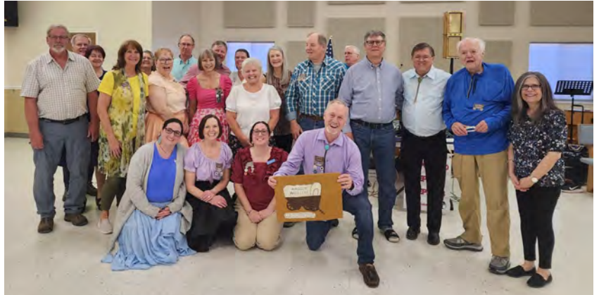
Waggin' Wheelers pose for a photo and show off their banner.