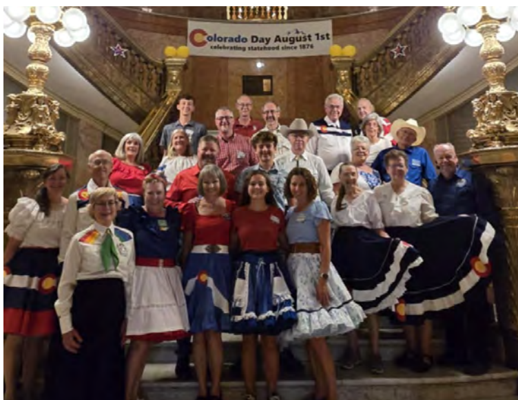
Dancers from area clubs the Pepper Steppers and Pikes Peak Plus squared up during the Colorado Day Dance at the State Capital on August 1.