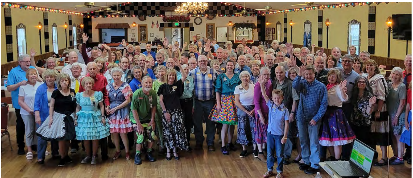
The Waggin Wheeler's hosted this year's Tumbleweed Jamboree on May 31 at the International Dance Center in Colorado Springs. Dancers posed for a group photo, with new dancers throwing their hands in the air.