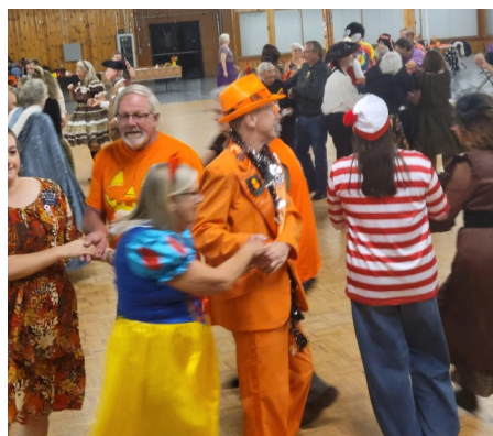
Dancers donned costumes for an evening of Halloween dancing.

The first annual Southeast Swing was filled with dancers dressed in costume, fast fun square dancing, smooth graceful round dancing, and lots of treats to keep the energy levels high.