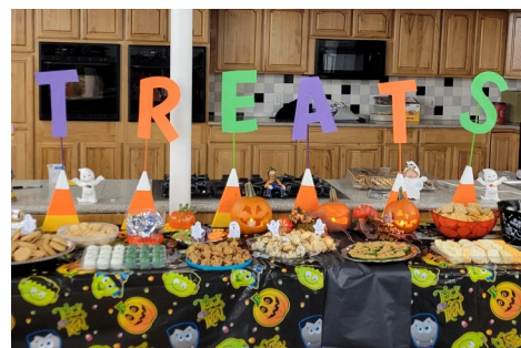
The TREAT table was an oft visited place throughout the weekend.

Syl Armijo and Lil Bargas took on the task of providing snacks and put out a huge spread of breakfast breads, cookies, sweets, veggies, chips, nuts, cheese, fruits, crackers, meatballs, and more. Lemonade and coffee too. Dancers contributed to the treat table which was much appreciated by all.