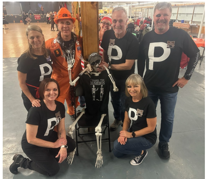
Waggin' Wheelers at Southeast Swing? Nope. . . Black Eyed Peas.

Ask any of these athletes about their experiences, and think about cranking up your Plus dancing and hitting the road for St. George next October!