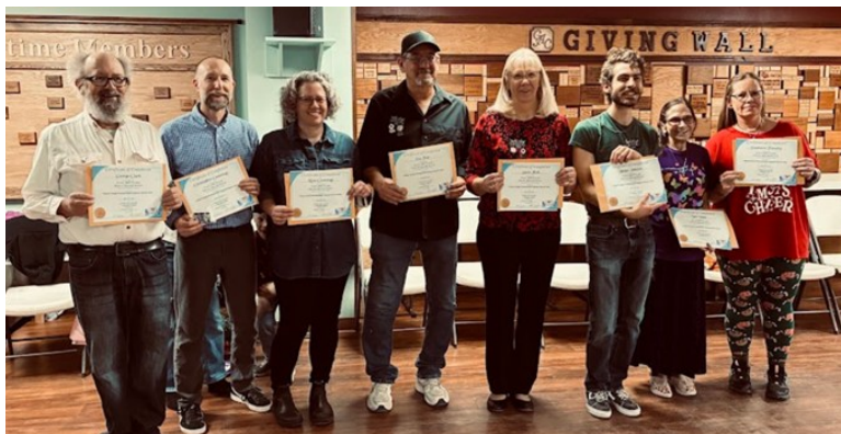
The second class offered by RPG saw nine students graduate in the Fall of 2025.