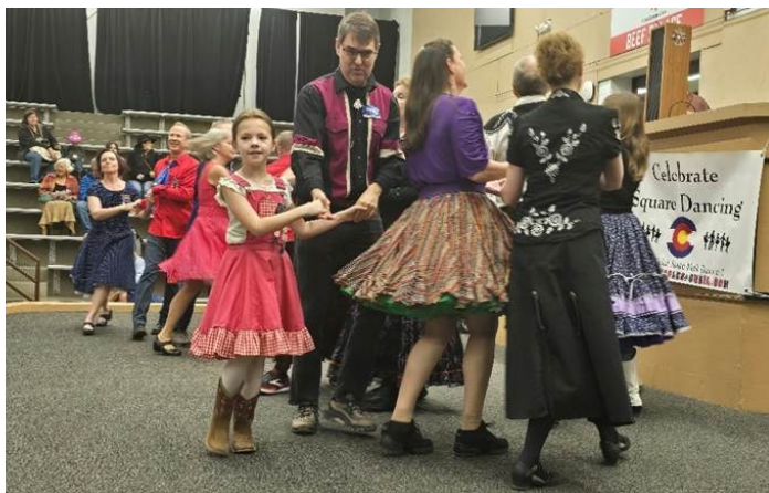
RPG dancers, and those from other area clubs, attended the National Western Stock Show and performed a demonstration dance.

Promenaders have been spotted at dances in Englewood at the Kilowatt Eights and in Castle Pines at the Sunflower Squares, as well as visiting the Rolling Wheels in Wheat Ridge, Colorado.