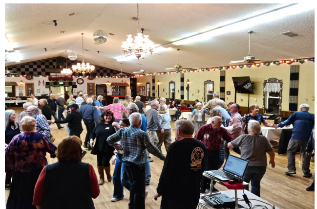
High spirits at a recent Pikes Peak Plus Dance