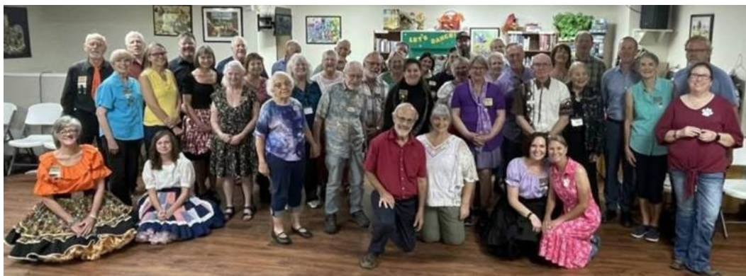
Forty-one area club dancers attended the inaugural dance of the Royal Gorge Promendaders.