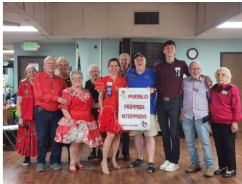
Group photos are great news-letter photos. This one provided by the RPG.

The club Google sites can now be used by the club to post whatever photos they want for their own use. A