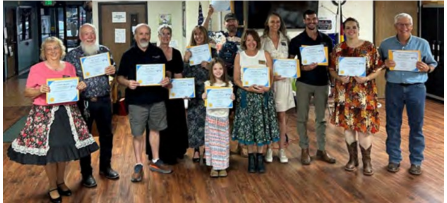
RPG graduated 17 students from their first class in July 2025. Nine graduated in a subsequent class that fall. A new class is currently being planned for the Spring.

An amazing 24 charter members joined that night!! Two