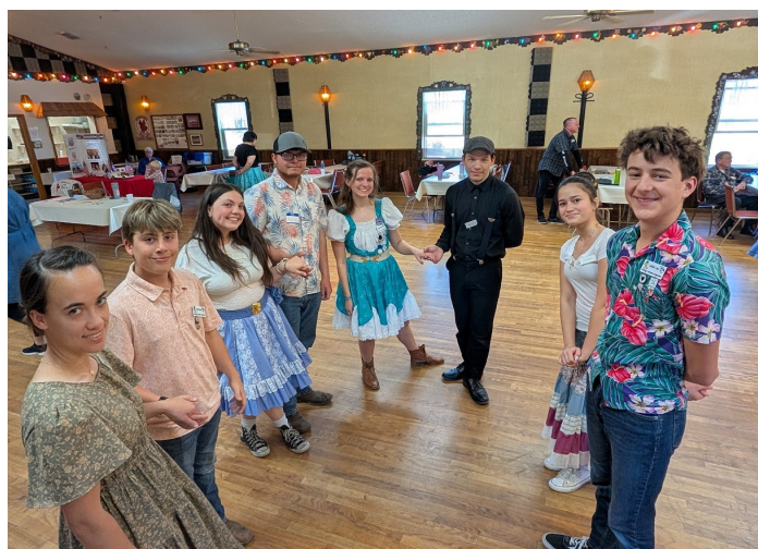
It is so exciting to have so many young dancers on the floor these days. Their numbers continue to grow and their enthusiasm makes them such fun to dance with!

This year's winners of the Lloyd Shaw and Hall of Fame Awards were recognized. Be sure to read all about these awesome square dance leaders on the following pages.