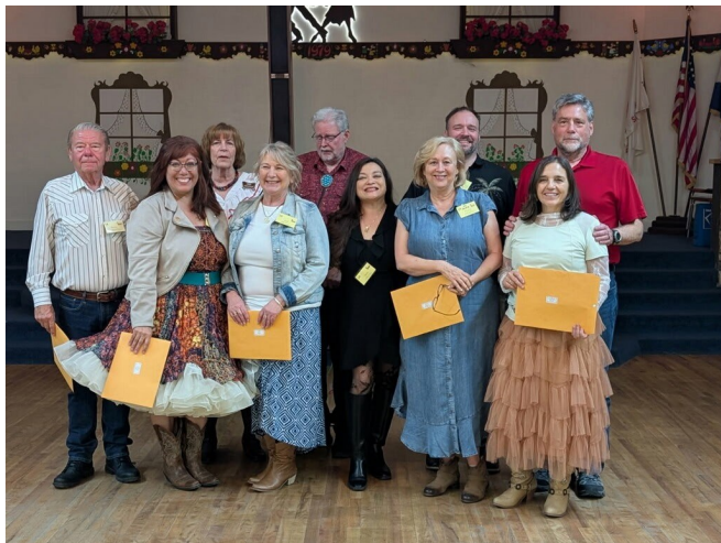
Waggin' Wheeler graduates.