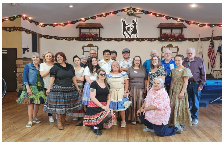
New graduates were able to put their newly acquired square dance skills to the test at this year's Tumbleweed Jamboree.