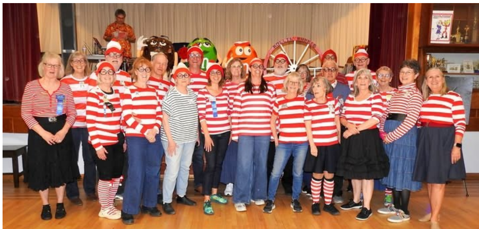
Dancers from the Pueblo Pepper Steppers joined Rollin' Wheels for their Where's Waldo Dance in March.

Pueblo Pepper Steppers currently have 44 members and the club is wrapping up their current class of 16 students with graduation on May 16th. PPS is sponsoring Tumbleweed Jamboree on May 2nd this year and their new students will be ready to dance. The class includes 10 dancers who are college-age or younger.