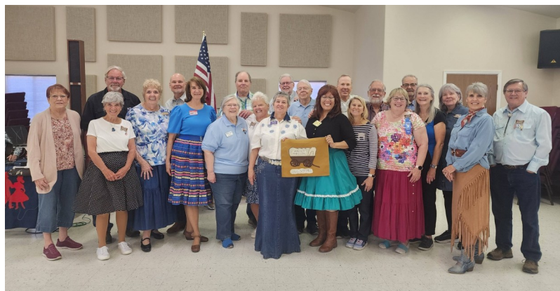
Waggin' Wheeler dancers showed up en mass to retrieve their banner from the Pueblo Pepper Steppers.