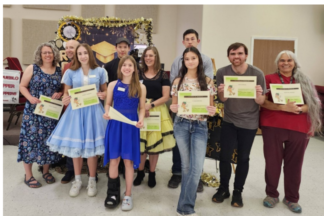
PPS graduates, May 2026.

Two of our students and several of our club members were able to attend the May 2 Tumbleweed Jamboree.